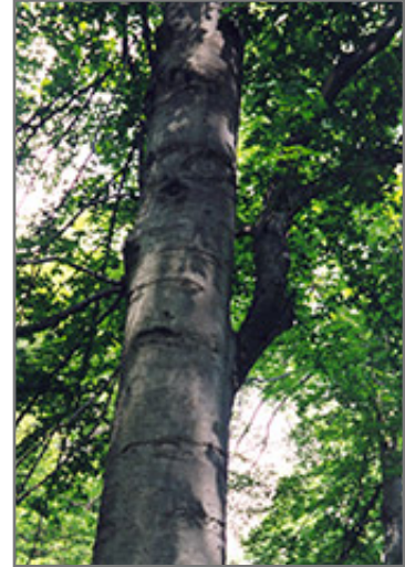
American Beech bark

This tree should only be grown in full sunlight. It requires an evenly moist well-drained soil for optimal growth, but will die in standing water. It is not particular as to soil pH, but grows best in rich soils. It is quite intolerant of urban pollution, therefore inner city or urban streetside plantings are best avoided, and will benefit from being planted in a relatively sheltered location. This species is native to parts of North America.