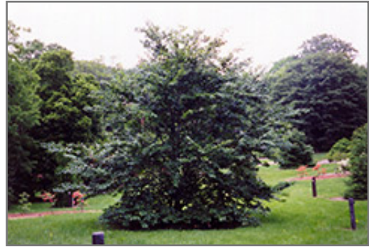
American Beech