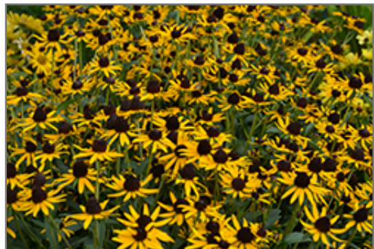
Little Goldstar Coneflower flowers