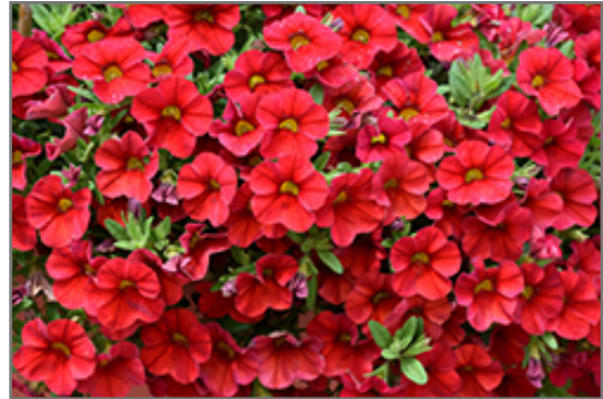
Superbells Red Calibrachoa flowers

Superbells Red Calibrachoa is recommended for the following landscape applications;