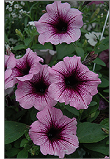
Supertunia Bordeaux Petunia flowers

Supertunia Bordeaux Petunia is recommended for the following landscape applications;