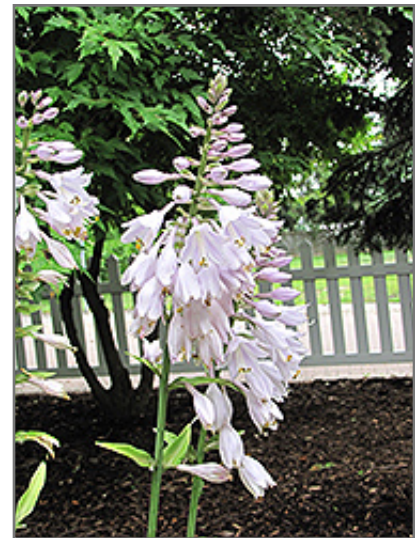
Key West Hosta flowers