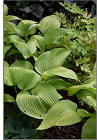
Key West Hosta

This plant does best in partial shade to shade. It prefers to grow in average to moist conditions, and shouldn't be allowed to dry out. It is not particular as to soil type or pH. It is somewhat tolerant of urban pollution. This particular variety is an interspecific hybrid. It can be propagated by division; however, as a cultivated variety, be aware that it may be subject to certain restrictions or prohibitions on propagation.