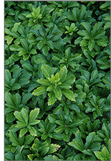
Green Sheen Japanese Spurge foliage