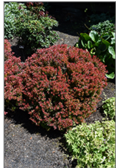
Golden Ruby Barberry

47747 Romeo Plank Road | Macomb, Mi 48044